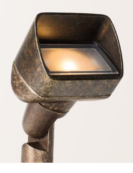
The PB is a compact LED wall wash lighting solution. Available in 1 or 3 LED with full color lens options of frosted, blue, amber, and green included. The wider angle of the PB allows a broader lighting option for larger structures and spaces. Engineered with solid construction, yet petite in size.